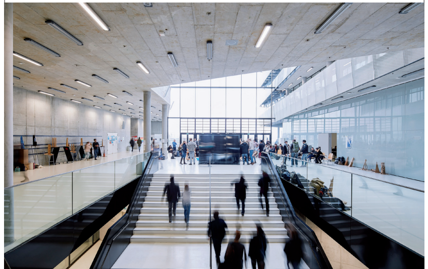
Fig. 1: Location of Hafencity University Hamburg on the river Elbe (top) and its interior (bottom)

pared to other universities as there are no specific departments or institutes. Instead, the discipline is integrated into the interdisciplinary Bachelor and Master school for teaching, the research school and some interdisciplinary research groups. The Master programmes are led by a dean of studies who is supported by a programme coordinator and a secretary. Currently, there are four professors teaching in »Geodesy and Geoinformatics« with additional help of about 20 scientific and technical staff.