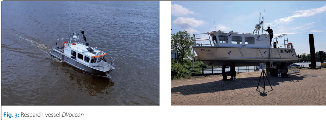
Fig. 3: Research vessel DVocean

in shallow waters to explore and monitor primary inland waterways and their built-up banks. Moreover, areas of application include the investigation of new approaches for position determination and bottom structure analyses to determine the stability of buildings and underwater structures. Initial measurements to create test fields for hydrographic sensors will be further acquired and analysed.