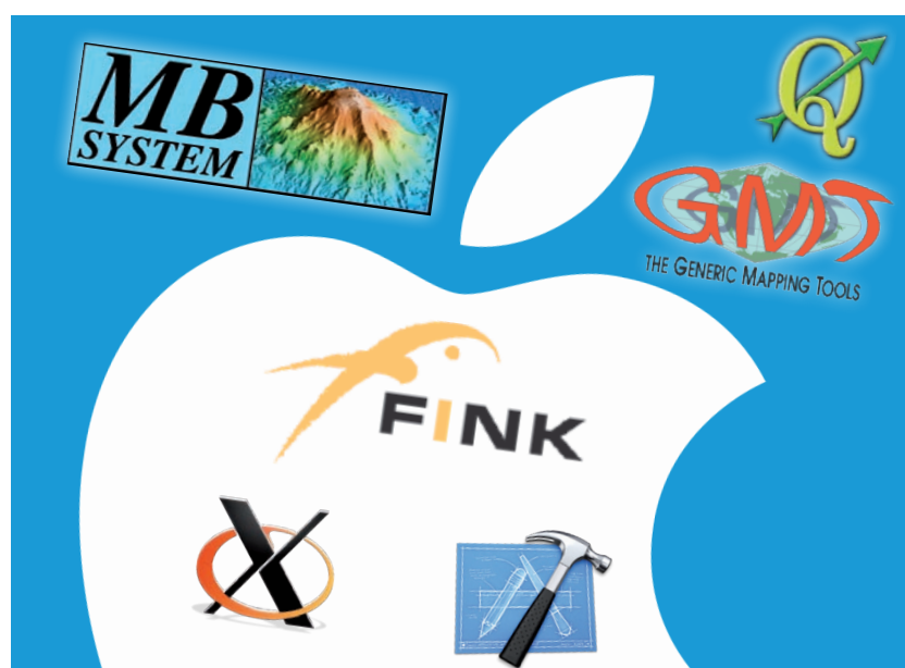
Fig. 1: Everything that is necessary to run hydrographic applications like MB-System or Quantum GIS on a Mac